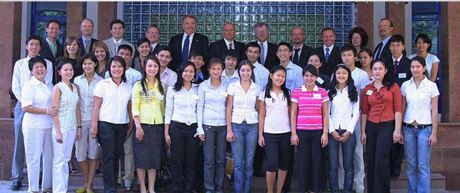
First cohort of U.S.-CAEF Student Fellows, Almaty, 2007