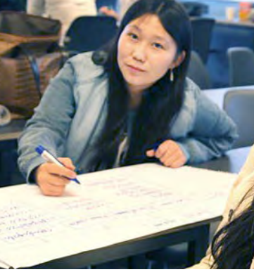
PROJECT MANAGEMENT TRAINING