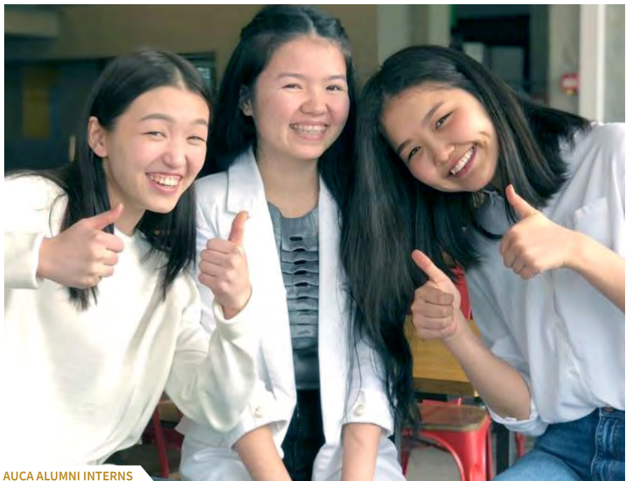
AUCA ALUMNI INTERNS