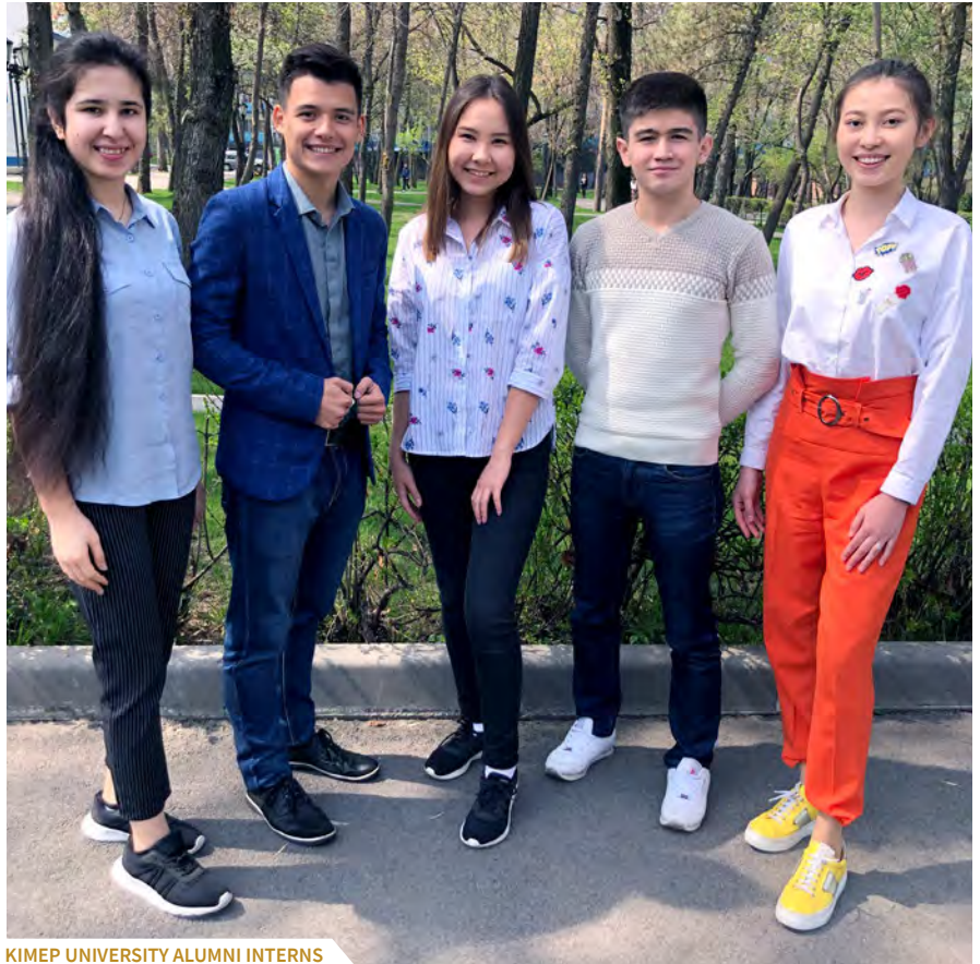
KIMEP UNIVERSITY ALUMNI INTERNS

The new alumni leadership team decided to hire eight current fellows from both partner universities to serve as interns for the U.S.-CAEF Alumni Association. The interns will act as liaisons between alumni and current fellows and provide a fresh perspective to the Alumni Association, and assist current officers in arranging events, gathering information, and conducting outreach with various alumni. Though, in some cases, several years separate the interns from the current Alumni officers in age, the common goal of promoting and supporting the U.S.-CAEF community will undoubtedly unite them.